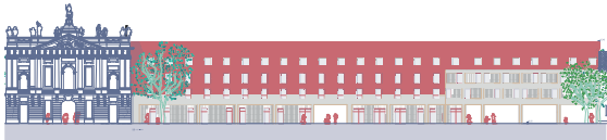
Ansicht: Townhouse | 1:250