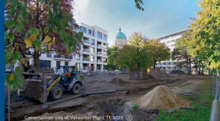
Construction site of Versailler Platz 11/2025 ⑤