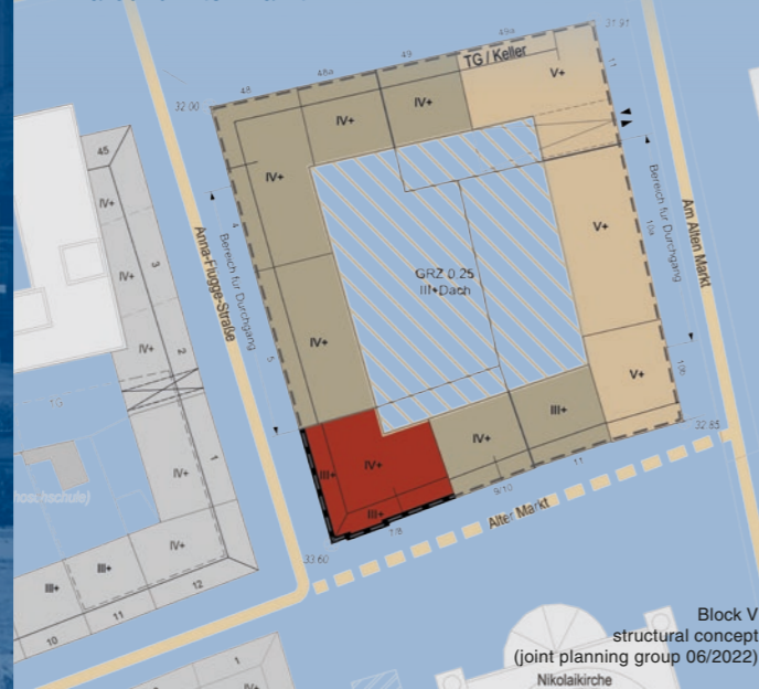
Block V structural concept (joint planning group 06/2022) Nikolaikirche

Preparing the development plan SAN-P 20 "Am Alten Markt/ Am Kanal" will create the legal basis for the implementation of the now defined redevelopment goals. The development of Block V completes the implementation of the urban redevelopment of the entire ensemble around Alter Markt.