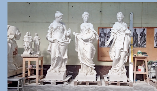
The Three Graces

Despite its small size, the "House of Music" built in Block III invites visitors to explore the building through its generous entrance on the ground floor. The façade of the upper floors is decorated with honeycomb or star-shaped elements following the design of the University of Applied Sciences that was demolished by 2018. Here, too, the decorated façades are being created entirely from scratch - from the first sketches to technical drawings and ultimately the craftsmanship of a metalworker. Despite the diversity of the new buildings, they are all united by an aspiration for high-quality details through craftsmanship.